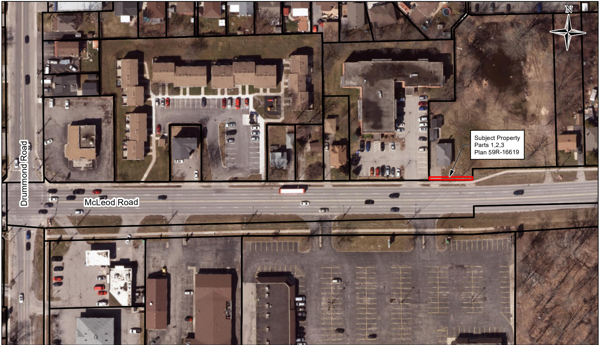
ILLUSTRATION SHOWING APPROXIMATE LOCATION OF ROAD WIDENING ALONG REGIONAL ROAD 49 (McLEOD ROAD ) NIAGARA FALLS