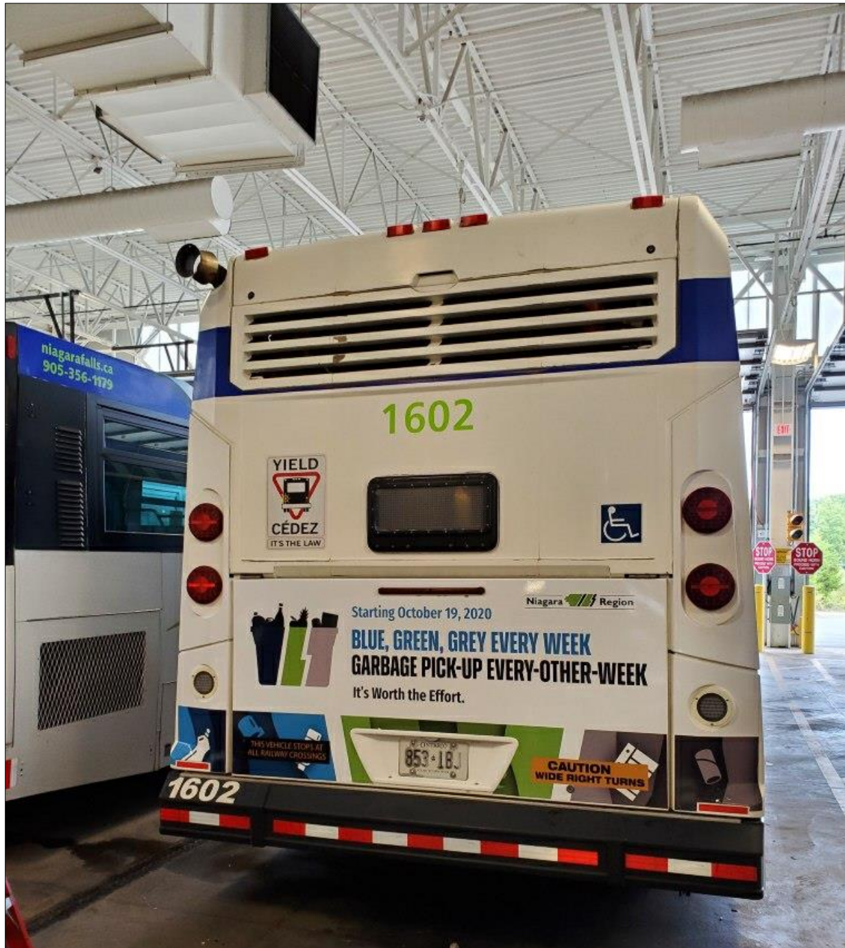
Figure 1: Example of a bus ad currently running in Niagara Falls, St.Catharines, and Welland