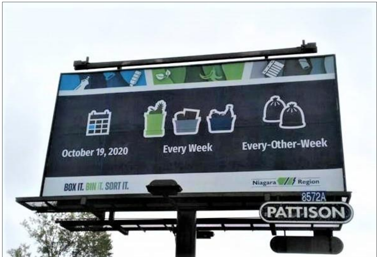
Figure 2: Example of a campaign billboard advertisements