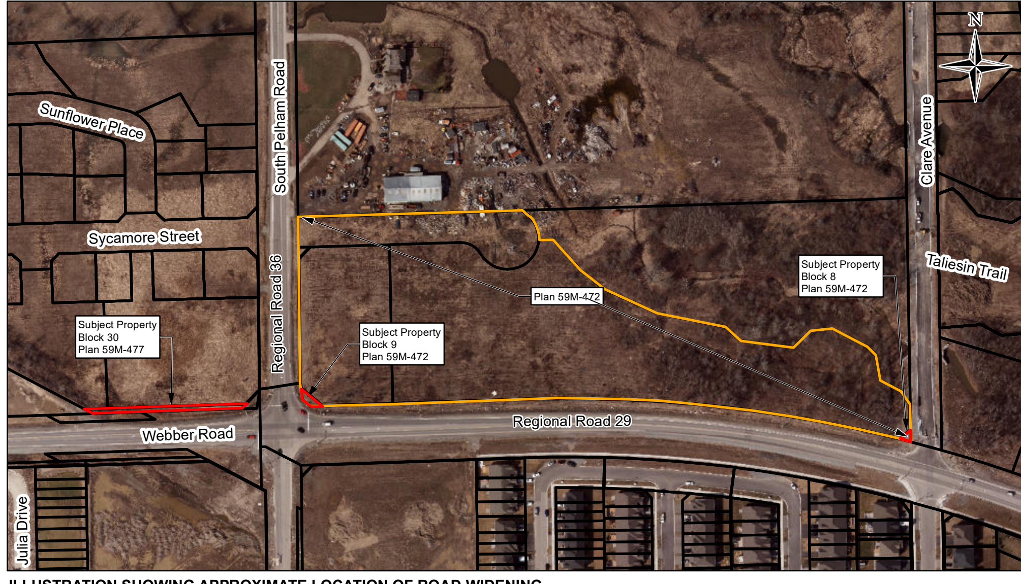
ILLUSTRATION SHOWING APPROXIMATE LOCATION OF ROAD WIDENING ALONG REGIONAL ROAD 29 (WEBBER ROAD) CITY OF WELLAND