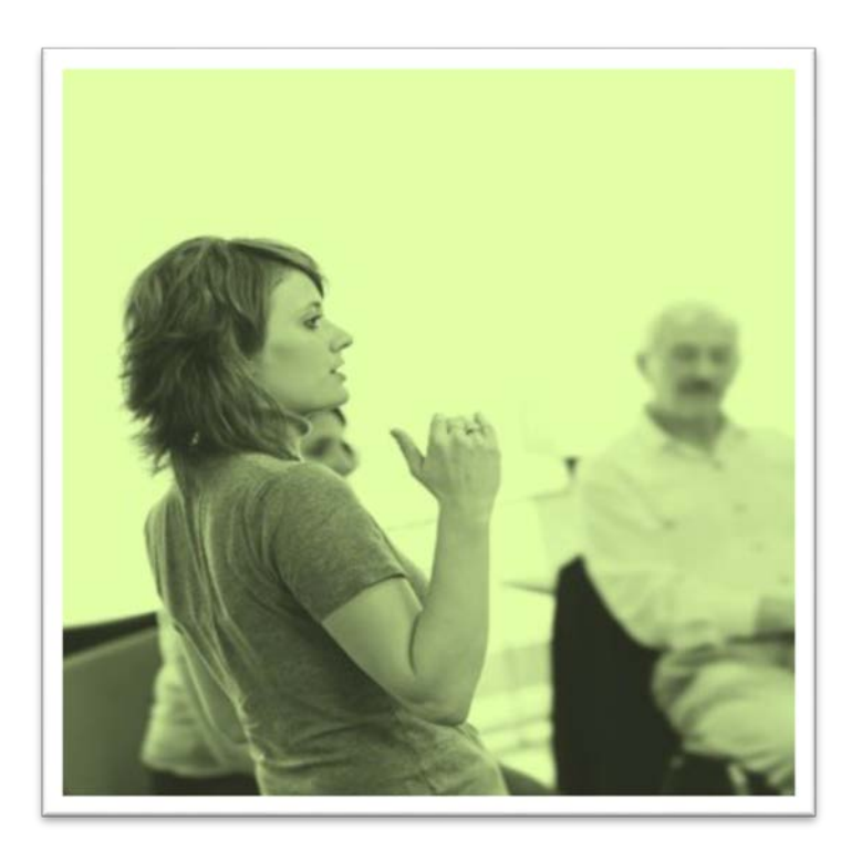
Third-party facilitated focus groups