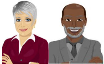
Leaders (197) Project Managers (54)