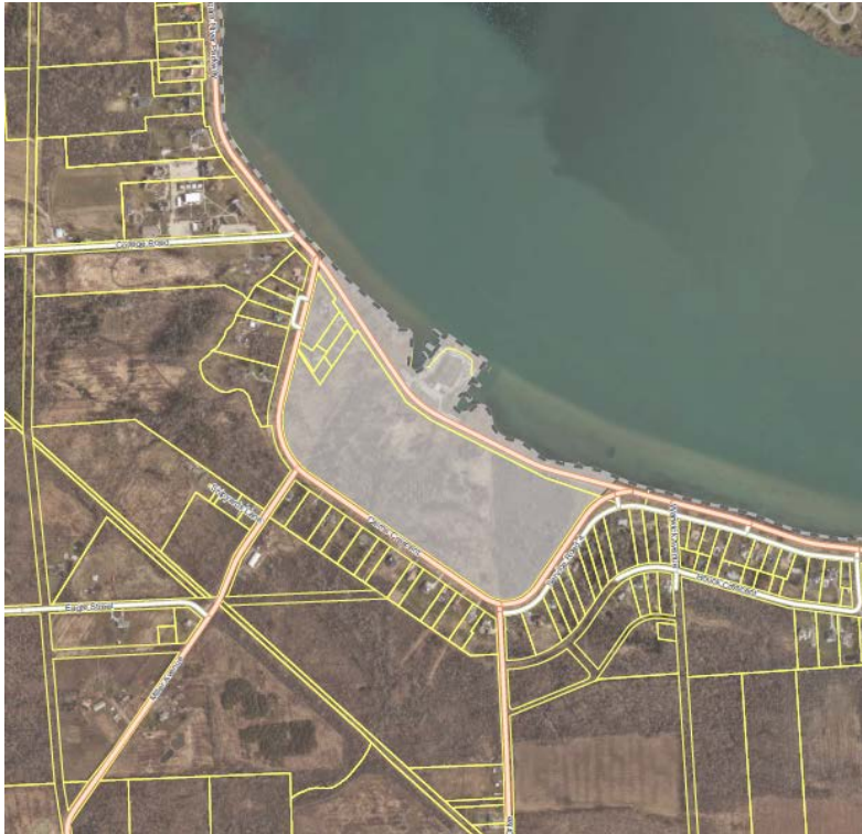
Figure 1: Miller's Creek Marina