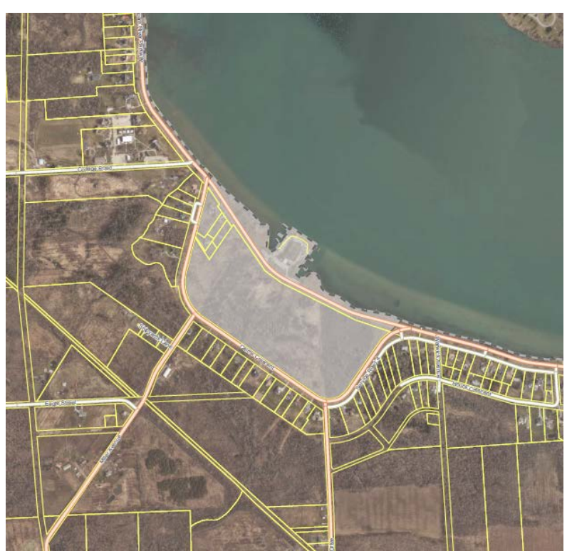
Figure 1: Miller's Creek Marina