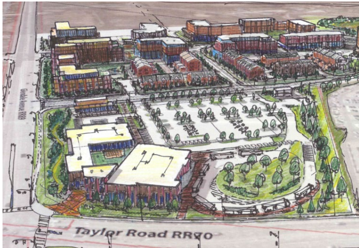
Renderings for illustration purposes only