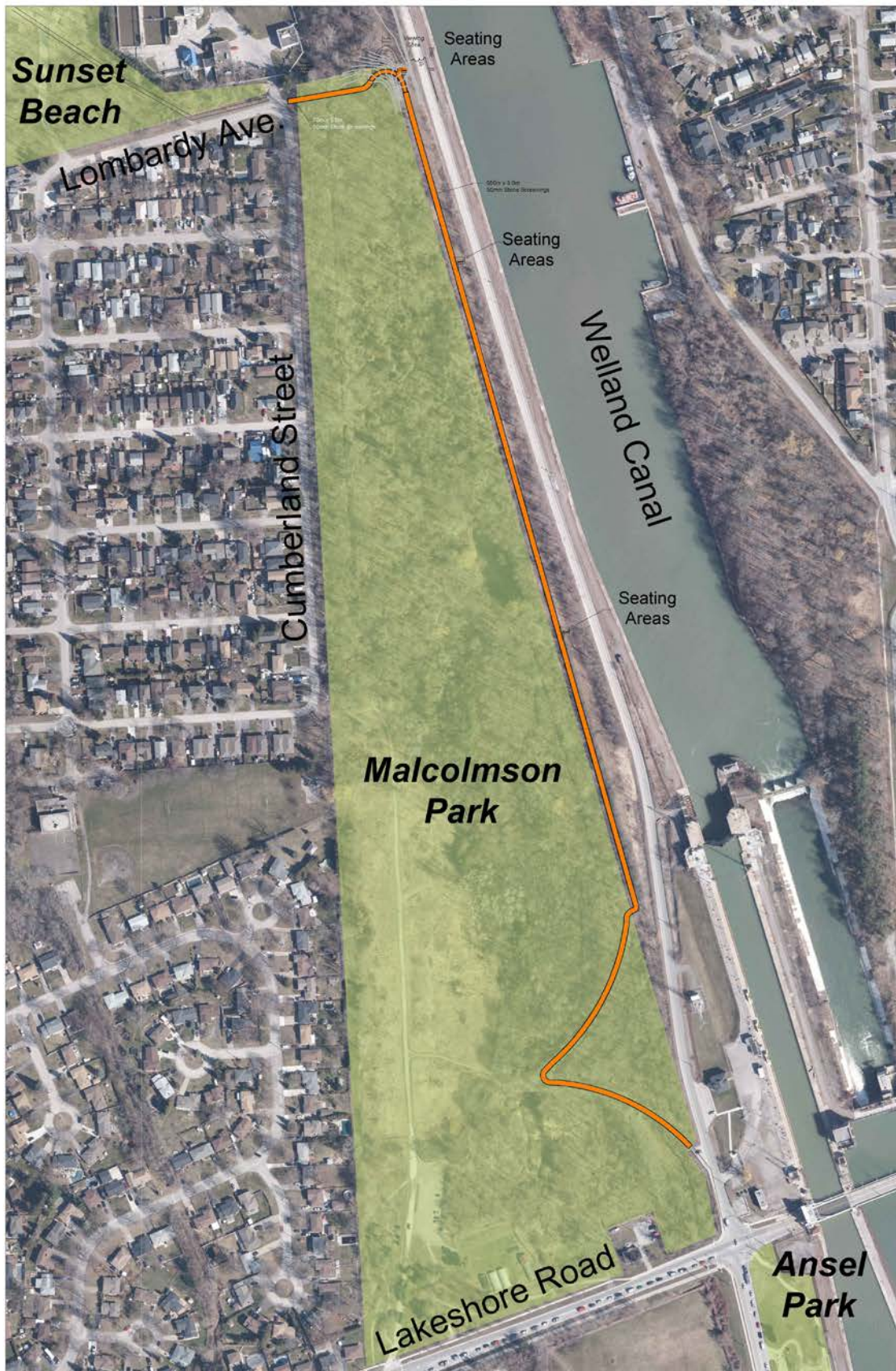
GNCR Lakeshore Extension- Malcolmson Park to Sunset Beach