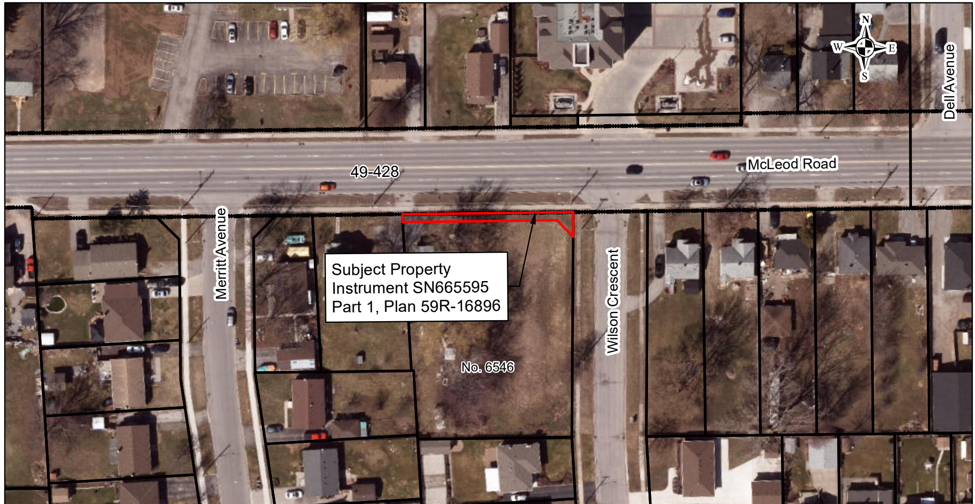
ILLUSTRATION SHOWING APPROXIMATE LOCATION OF ROAD WIDENING AT No 6546 McLEOD ROAD - REGIONAL ROAD 49 AT WILSON CRESCENT CITY OF NIAGARA FALLS