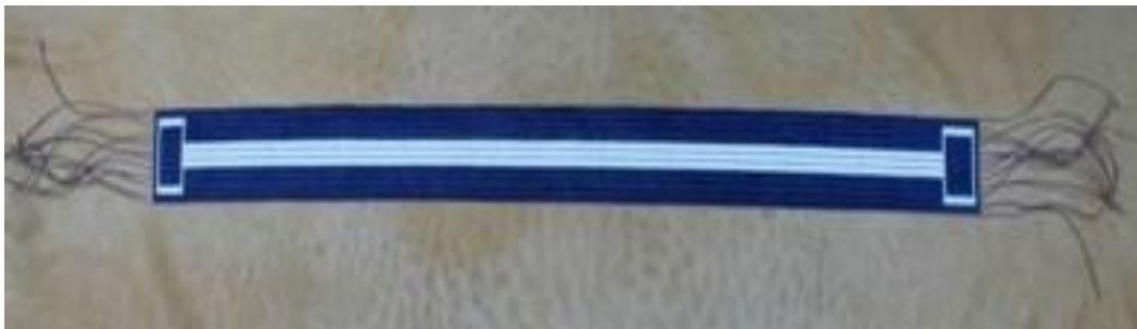
Figure 1: Iroquois-Ojibwa Friendship Belt.

The image below shows two white squares with a white line joining them. The squares symbolize and represent the confederacy of each group, the Haudenosaunee and Anishinaabe, and the white line symbolizes the path of peace between them.