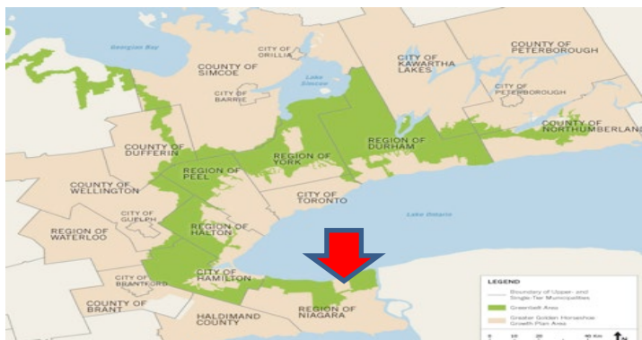
Figure 1: Region of Niagara within the Greater Golden Horseshoe