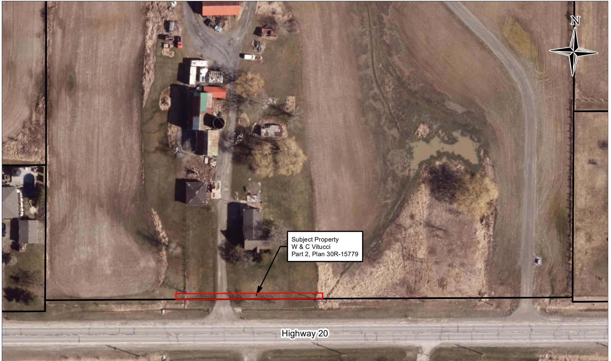
ILLUSTRATION SHOWING APPROXIMATE LOCATION OF ROAD WIDENING FROM W & C VITUCCI ALONG REGIONAL ROAD 20 (HW20) TOWNSHIP OF WEST LINCOLN

DISCLAIMER This map was compiled from various sources and is current as of 2020. The Region of Niagara makes no representations or warranties whatsoever, either expressed or implied, as to the accuracy, completeness, reliability, and currency or otherwise of the information shown on this map. © 2015 Niagara Region and its suppliers. Projection is UTM, NAD 83, Zone 17. Airphoto (Spring 2018)