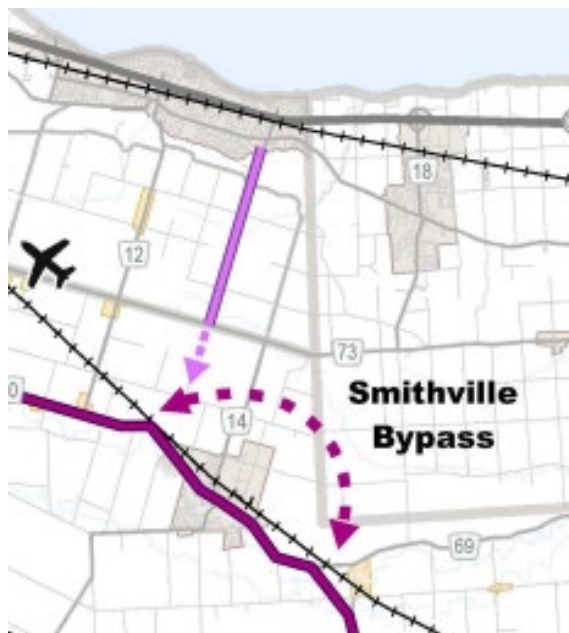
New Escarpment Crossing and the Smithville Bypass