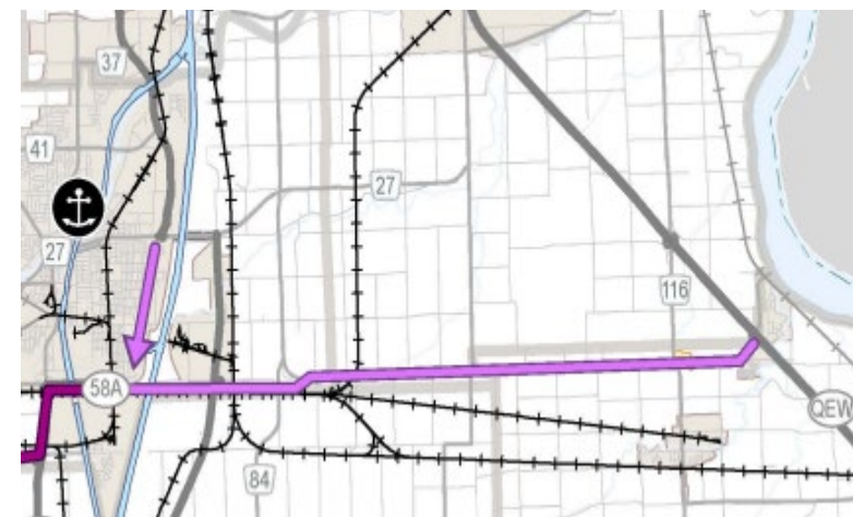
South Niagara East West Arterial Phase 1 Netherby Rd Capacity Expansion