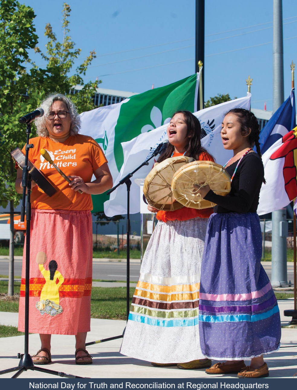
National Day for Truth and Reconciliation at Regional Headquarters