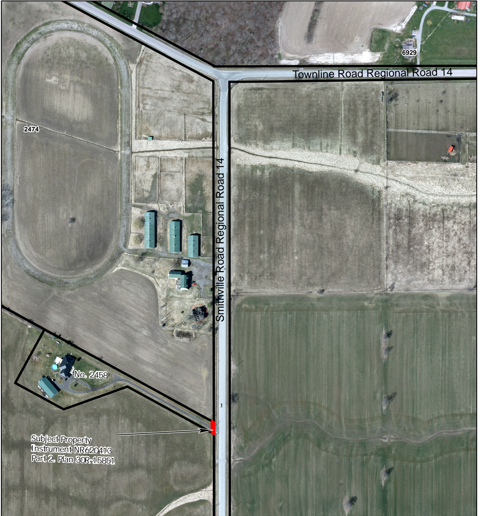
ILLUSTRATION SHOWING APPROXIMATE LOCATION OF WIDENING No. 2458 SMITHVILLE ROAD- REGIONAL ROAD No. 14 TOWNSHIP OF WEST LINCOLN