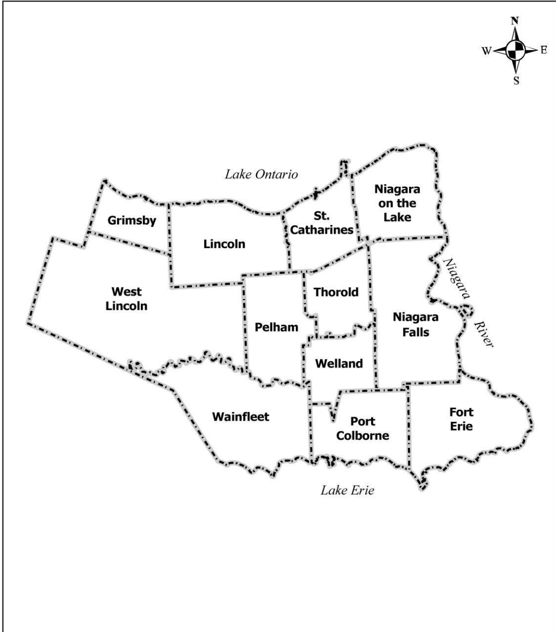
Regional Municipality of Niagara