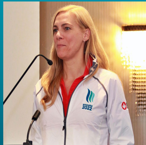
The Honourable Pascale St-Onge, Minister of Sport and Minister responsible for the Economic Development Agency of Canada for the Regions of Quebec

And this phenomenal success was achieved despite the many challenges posed by a global COVID pandemic that caused these Games to be postponed for one year - from 2021 to 2022.