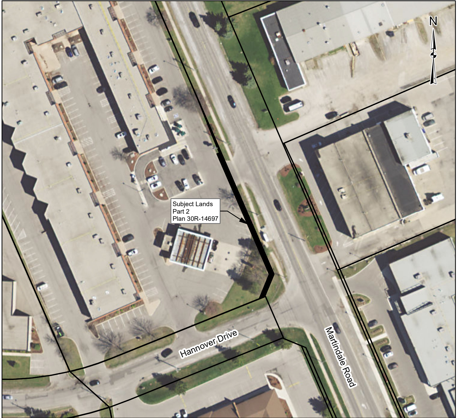
ILLUSTRATION SHOWING APPROXIMATE LOCATION OF ROAD WIDENING ALONG REGIONAL ROAD No.38 (MARTINDALE ROAD) AT HANNOVER DRIVE CITY OF ST. CATHARINES