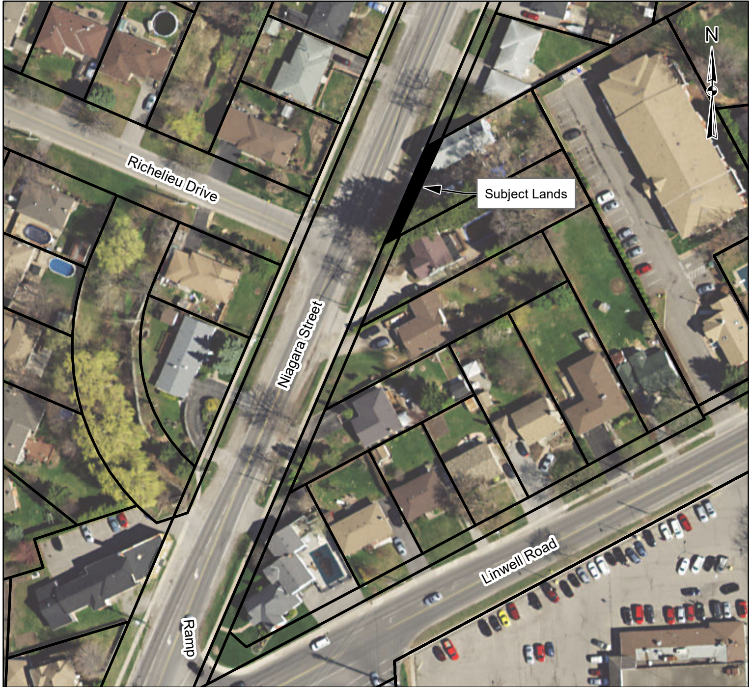
ILLUSTRATION SHOWING APPROXIMATE LOCATION OF ROAD WIDENING ALONG REGIONAL ROAD No.48 (NIAGARA STREET) TOWN OF NIAGARA ON THE LAKE