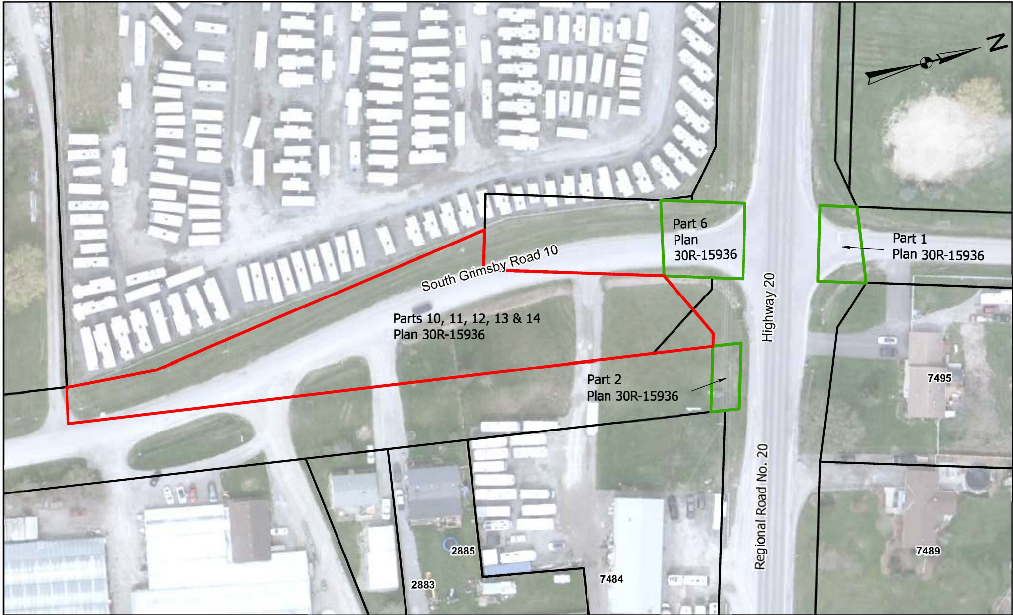
ILLUSTRATION SHOWING APPROXIMATE LOCATION OF DOWNLOAD AND UPLOAD LANDS SOUTH GRIMSBY ROAD 10 AT AT HIGHWAY 20-REGIONAL ROAD No. 20 TOWNSHIP OF WEST LINCOLN