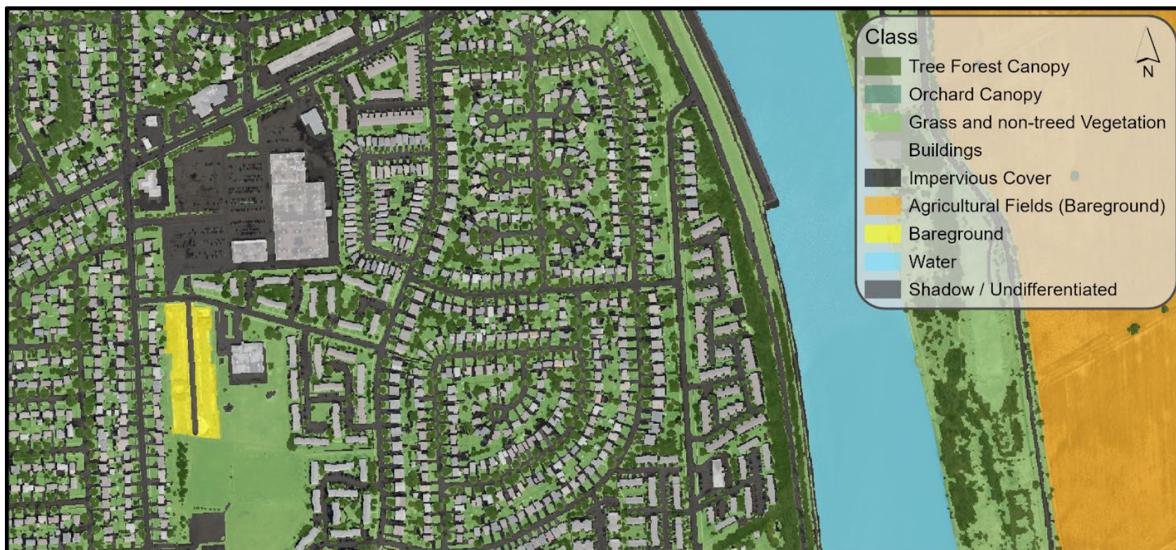
Figure 2: Example of the land classification data overlaid on aerial photography