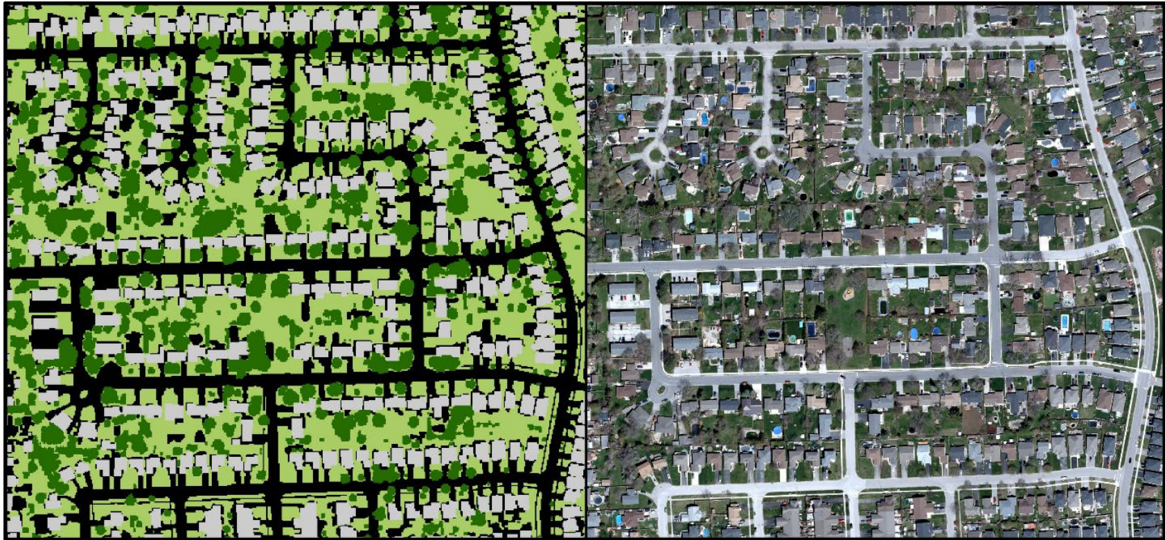
Figure 1: An area mapped with land classification data and an aerial photograph of the same area