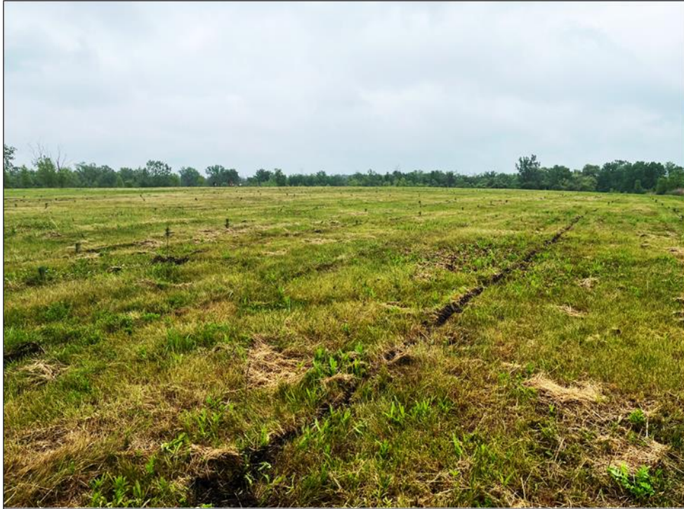
Figure 3: Site after Tree Planting Completed

As shown in Figure 4 below, biodegradable mulch mats were installed around each tree to improve seedling survival by reducing weed competition and preserving soil moisture.