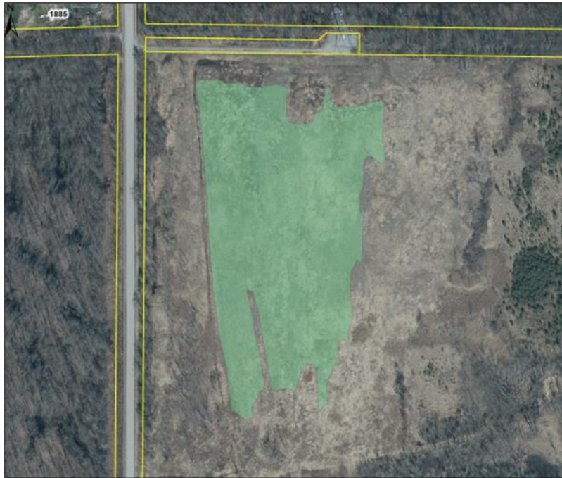
Figure 2: Planted Area on Winger Road Site

the seedlings. Using a combination of machine and hand planting methods, 3,996 deciduous and coniferous native trees were planted on 2.35 hectares of the property. The planting area is illustrated in Figure 2.