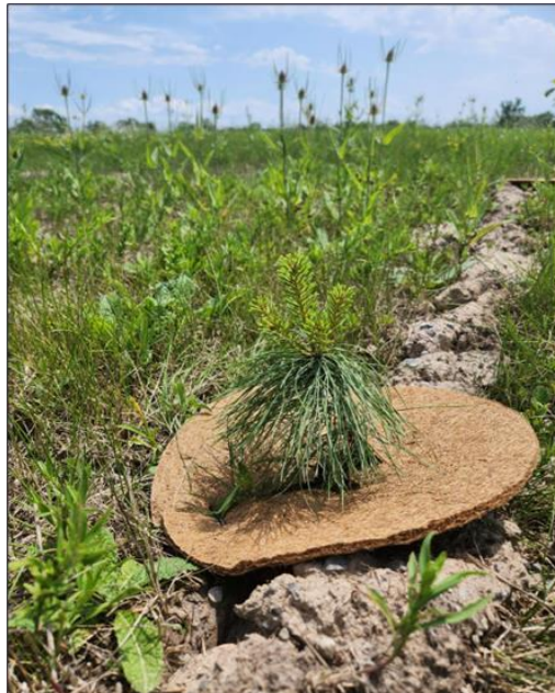
Figure 4: Seedling with Mulch Mat Installed

As shown in Figure 4 below, biodegradable mulch mats were installed around each tree to improve seedling survival by reducing weed competition and preserving soil moisture.