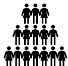
Figure 6: Niagara Region Fast Facts

Niagara Region’s population has continued to increase (6.7% from 2016-2021); in addition to external immigration, intra-provincial immigration to the region was the third highest in the province.