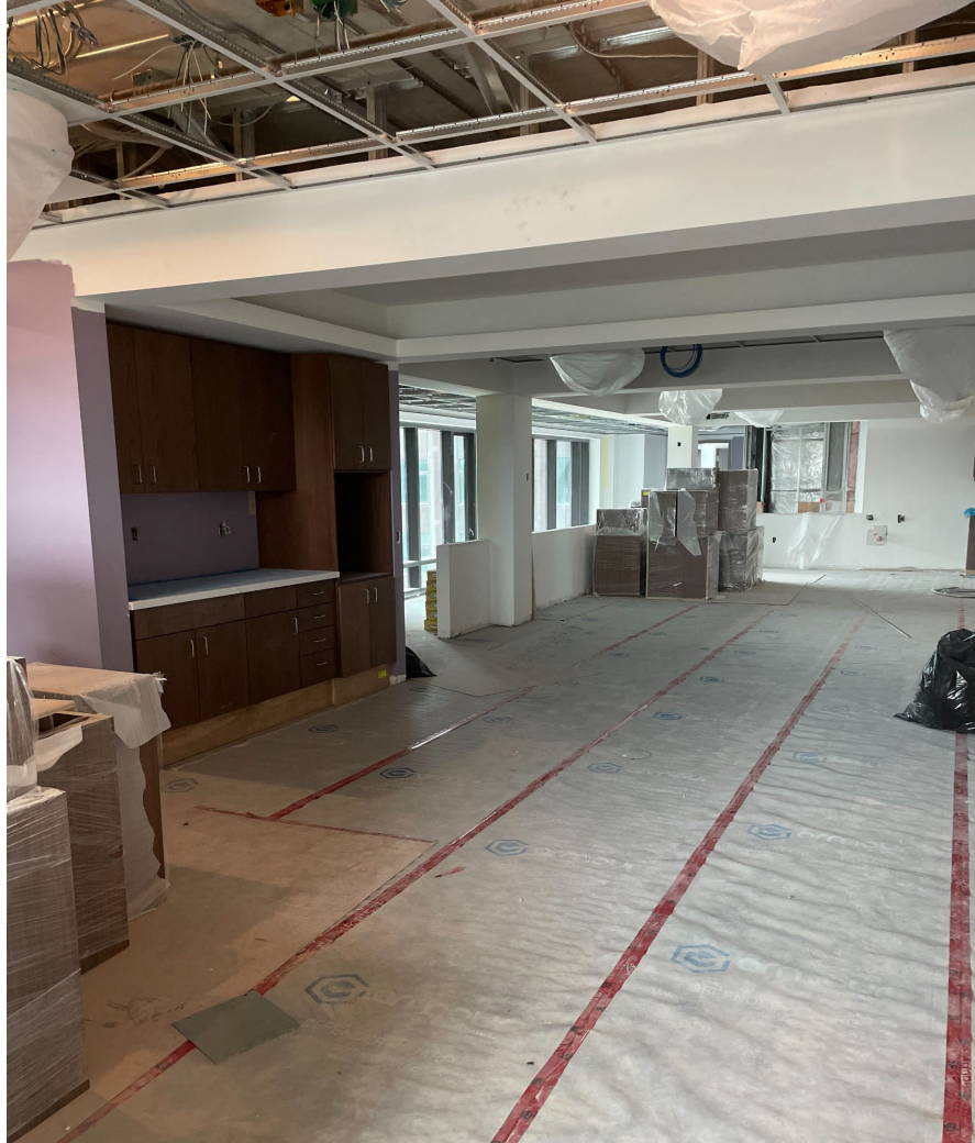
Sunroom / Dining Room