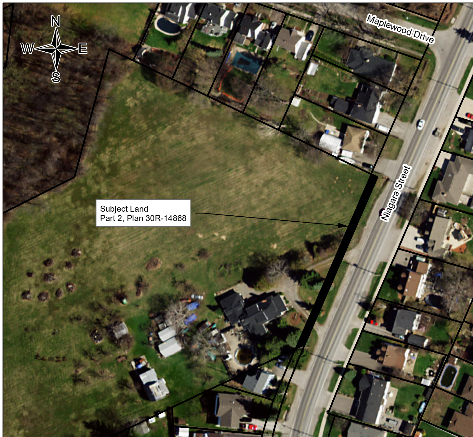
ILLUSTRATION SHOWING APPROXIMATE LOCATION OF ROAD WIDENING ALONG REGIONAL ROAD No.48 (NIAGARA STREET) CITY OF ST.CATHARINES