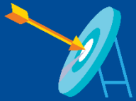
Strategy and Operations

Optimus SBR is an independently owned management consulting firm that works with organizations across North America.