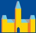
Governance & Leadership