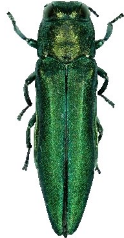
Emerald Ash Borer ( Agrilus planipennis )