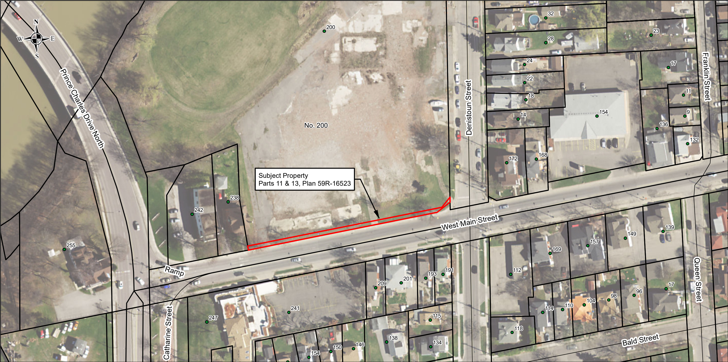
ILLUSTRATION SHOWING APPROXIMATE LOCATION OF ROAD WIDENING ALONG REGIONAL ROAD No.27 (WEST MAIN STREET) EAST OF REGIONAL ROAD No. 54 (PRINCE CHARLES DRIVE NORTH) CITY OF WELLAND