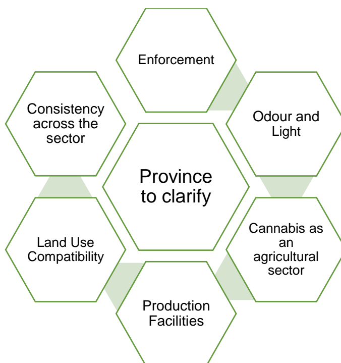
Table 5. Provincial clarification categories

In general local area municipalities (LAMs) are interested in understanding the tools available to municipalities for regulating cannabis cultivation and production and how best to work with these operations.