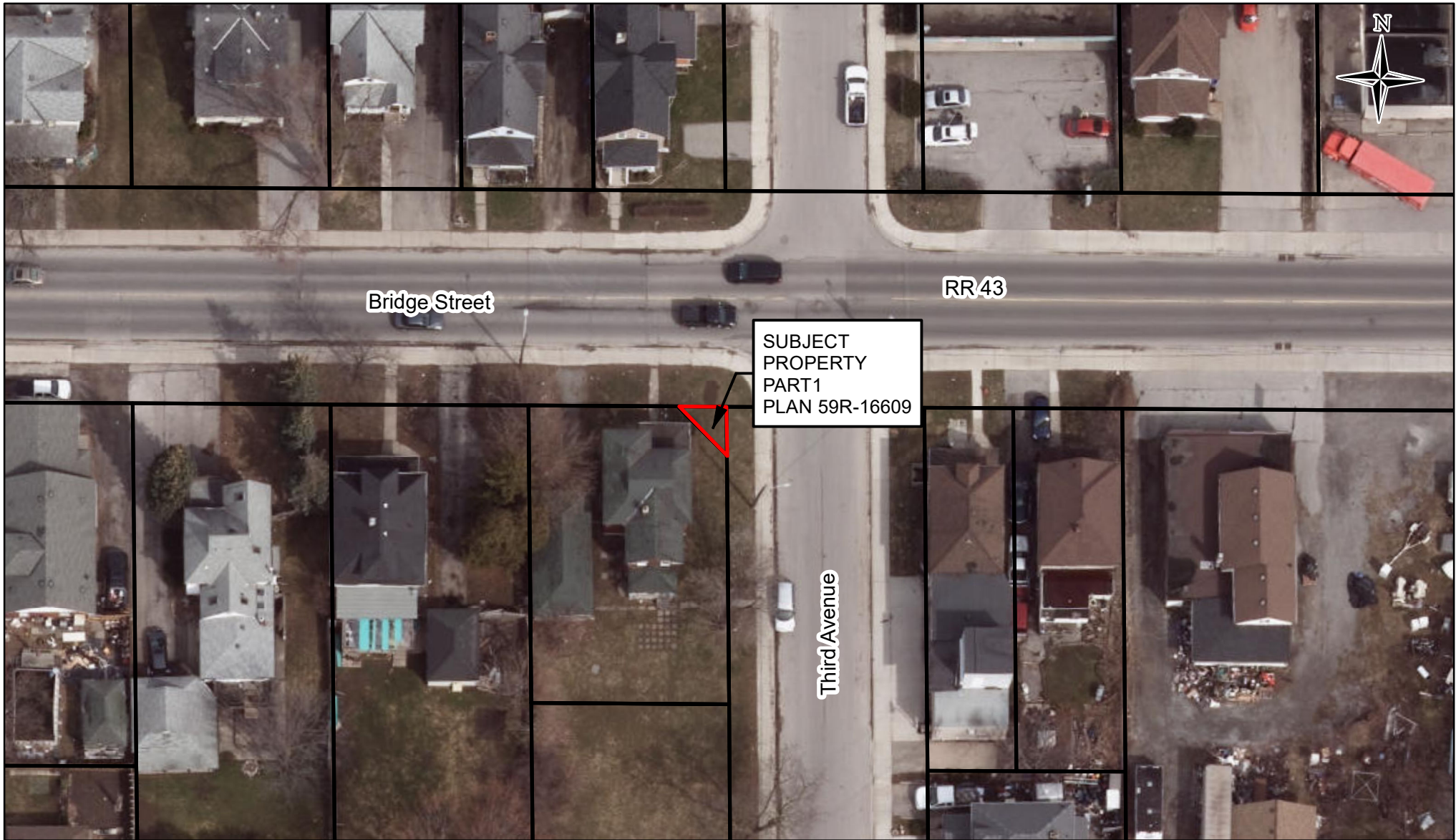
ILLUSTRATION SHOWING APPROXIMATE LOCATION OF ROAD WIDENING ALONG REGIONAL ROAD 43 (BRIDGE STREET) AT THIRD AVENUE CITY OF NIAGARA FALLS