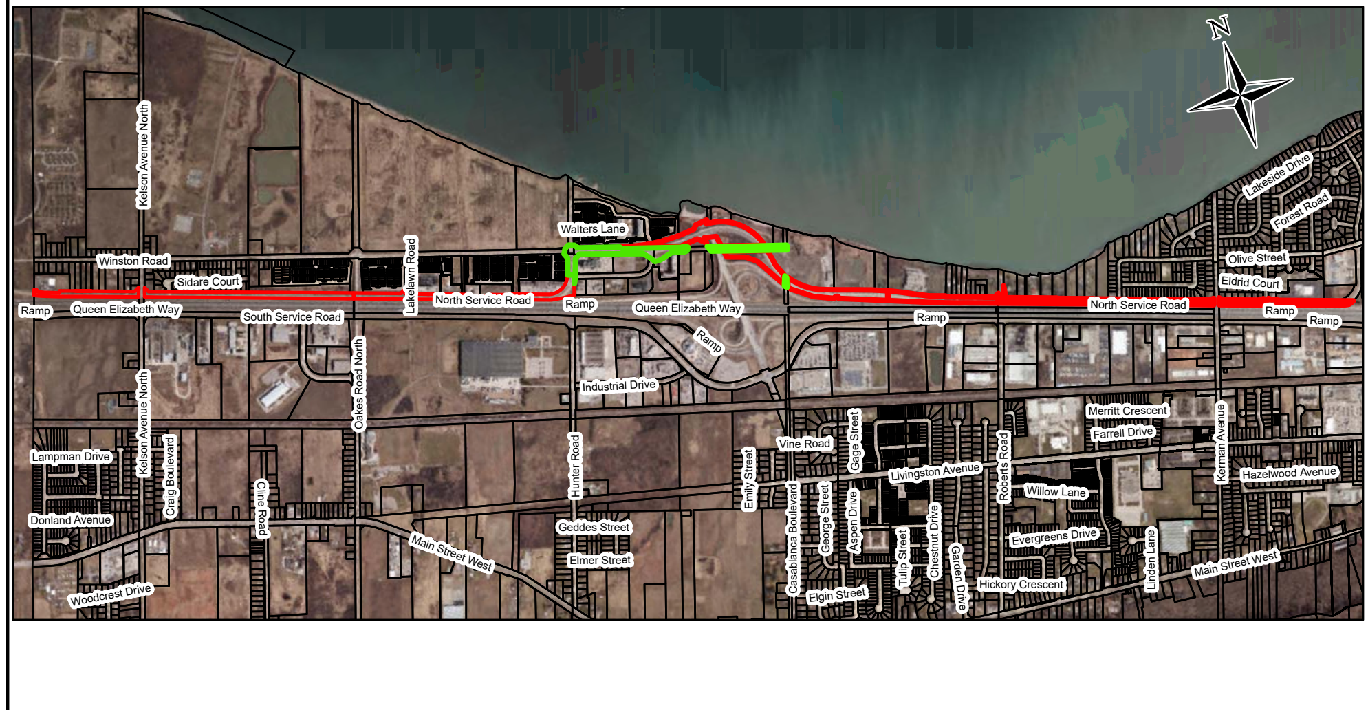
ILLUSTRATION SHOWING APPROXIMATE LOCATION OF NORTH SERVICE ROAD TOWN OF GRIMSBY