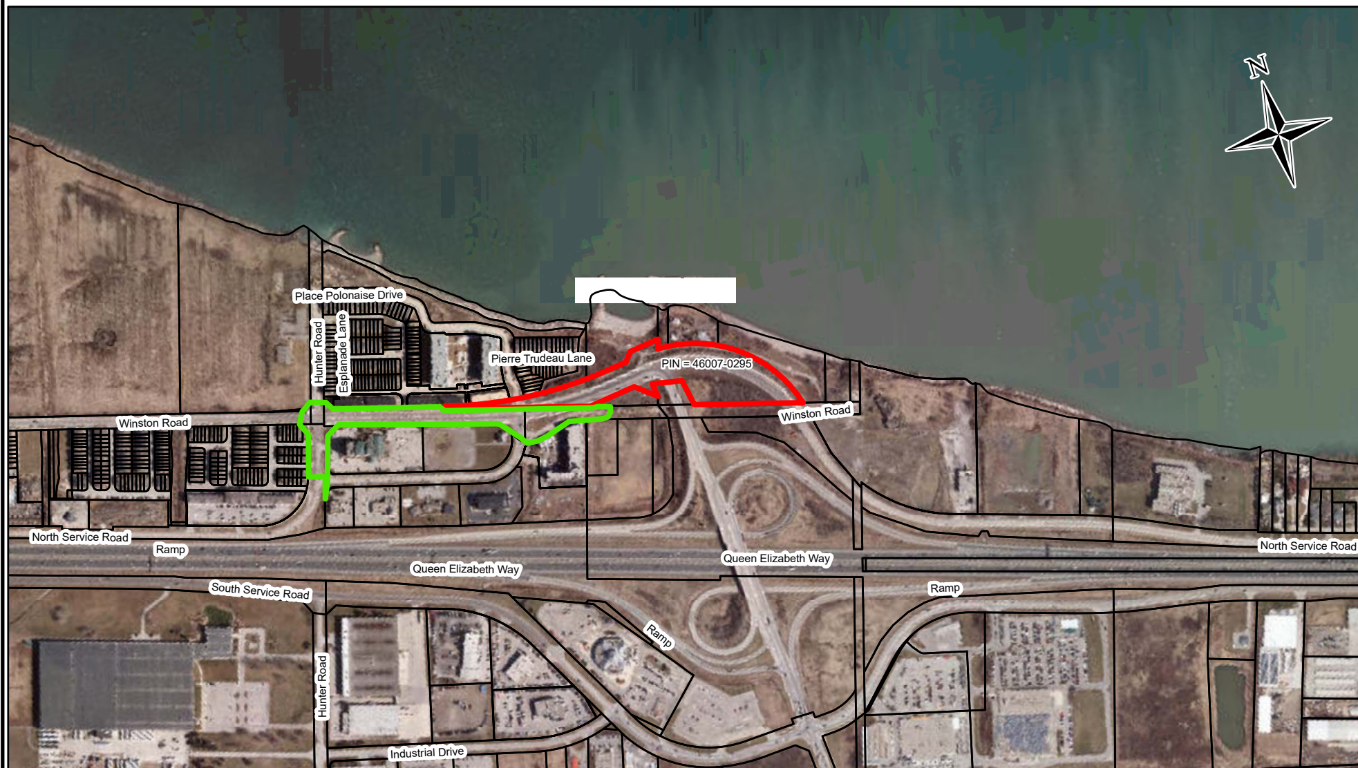
ILLUSTRATION SHOWING APPROXIMATE LOCATION OF NORTH SERVICE ROAD - DOWNLOAD - SECONDLY TOWN OF GRIMSBY